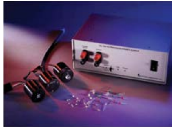
OL 700-10 FRONT PANEL

Control of the OL 700-10 is integrated into the application software of the OL 770-LED spectroradiometer to provide a total measurement package, incorporating remote switching and time setting. The OL 700-10 is also available as a stand-alone power supply and comes complete with all necessary software controls for USB interface.