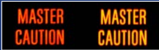
Actual Measurement Data and Display from Master Caution Light

The OL 770-NVS Application Software allows for turnkey automated operation while providing the user with easy and complete access to the system's full power and capabilities.