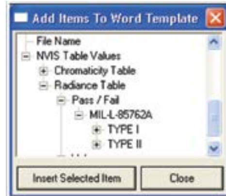
Report Template Builder!